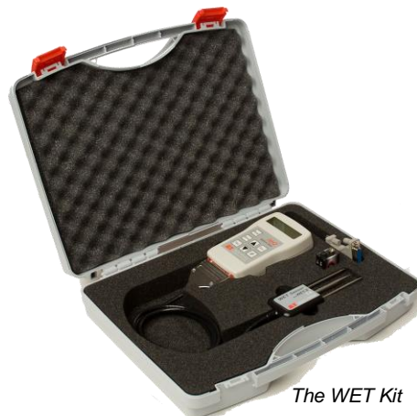
The WET Kit