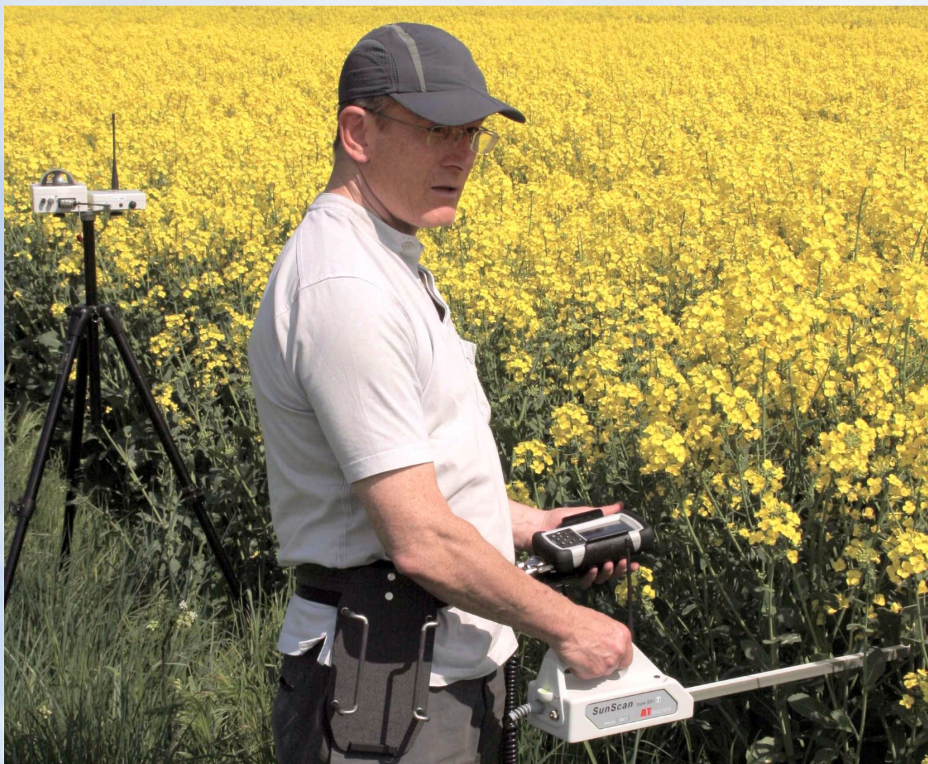
SunScan Probe (radio version) and PDA, with radio-linked BF5 Sunshine Sensor mounted on tripod