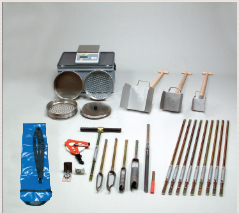
Set for the Building Materials Decree

In the auger set are included, amongst others: a handle with all synthetic grip, an Edelman auger combination type in two diameters, a Riverside auger in two diameters, a gouge auger, extension rods and a bent spatula. All equipment can be transported in a carrying bag for field equipment.