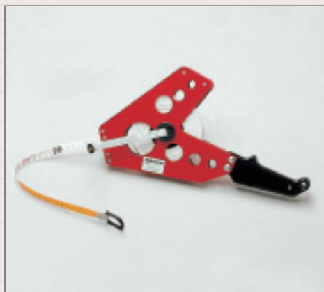
Synthetic measuring tape