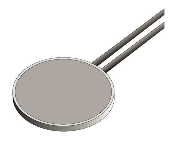
Figure 1: outlook