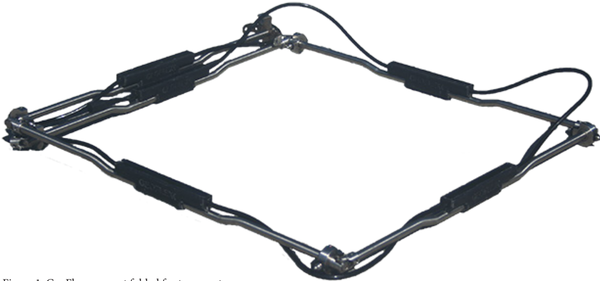
Figure 1: GeoFlex segment folded for transport

GeoFlex systems have joints capable of bending to 90°, allowing for a compact shipping option. Five segments, each 10 feet long, can be shipped in a carton measuring approximately 26 x 26 x 26 in (64 x 64 x 64 cm) and which weighs less than 50 pounds (22 kilograms). This allows for the system to be shipped via common over-night carrier as well as fit in most standard vehicles.