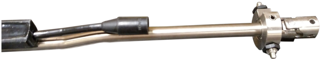
Figure 4: GeoFlex bottom node (female connector and universal joint)