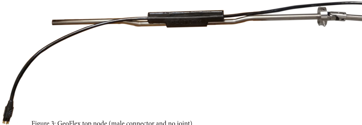
Figure 3: GeoFlex top node (male connector and no joint)

Custom Segments: The GeoFlex segments can also be manufactured in shorter lengths of 2, 4, 6 or 8 ft in length (with 1, 2, 3 or 4 nodes, respectively). Each of these segments also has a male connector at the upper end and a female connector at the lower end. The upper end can also be identified by its lack of joint on the node. The lower end has a universal joint, as can be seen in the images below.