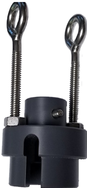
Figure 2: GeoFlex suspension kit for PVC pipe

Suspension Kit: One suspension kit is used for each string.