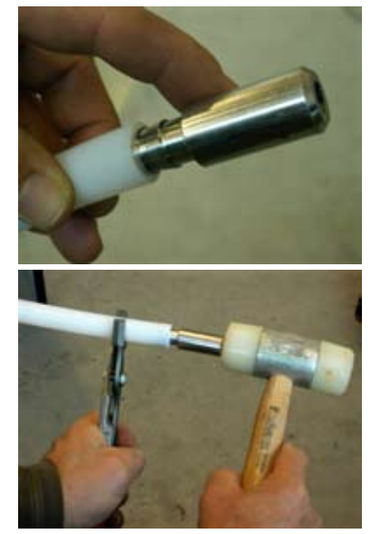
Fig. 10 Mounting a valve