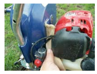
Fig. 5 Pass strap behind electric cables