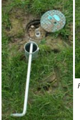
Fig. 4 One central ground anchor installed under the engine