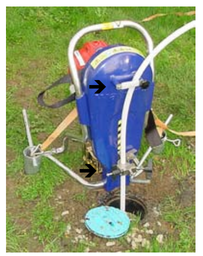
Fig. 12 Tubing fixed in upper and lower tube guide