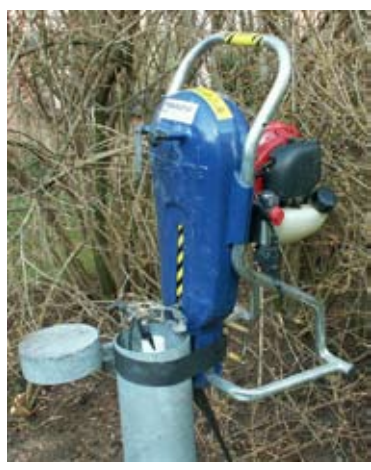
Fig. 3 Strap fixed around casing