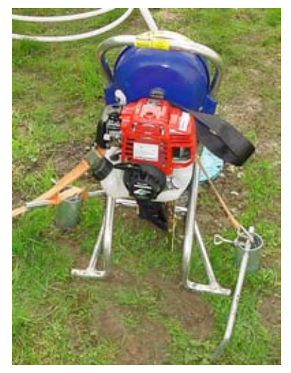
Fig. 7 Two anchors are used to install the actuator