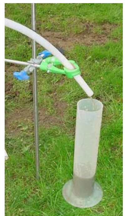
Fig. 16 Measuring the flow

tubing. A small filter or a plugged large one will block the water flow! This will simply blow off the valve at the bottom of the tubing! So set the pump at the lowest speed or actuate the tube purely by hand.