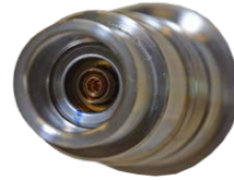
New Quadrax connector