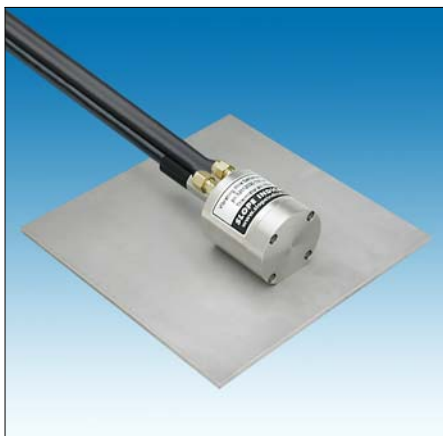
Non-Vented VW Settlement Cell