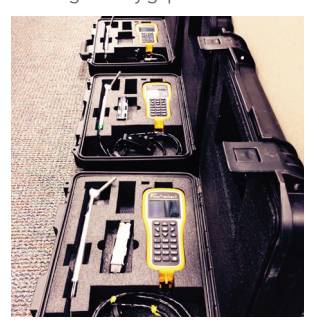
Rugged case provided standard with instrument