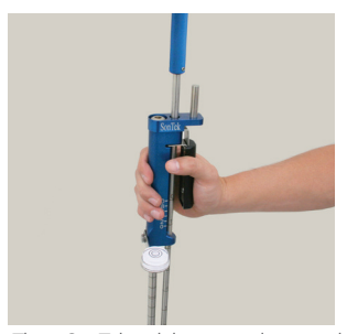
The SonTek deluxe wading rod, featuring a sturdy grip and bubble level