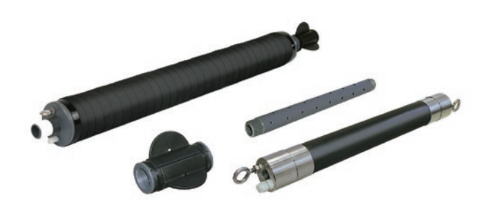
Model 800 Packers 3.9" and 1.8" (99 mm and 46 mm)

Model 800 Low-Pressure Packers can be used with Solinst Bladder Pumps to minimize purge times by reducing purge volumes. This reduces the cost of water disposal and labour. Packers are available in single point or straddle packer designs, and in sizes to fit 2" (50 mm) to 5" (127 mm) dia. wells. (See Model 800 Data Sheet.)