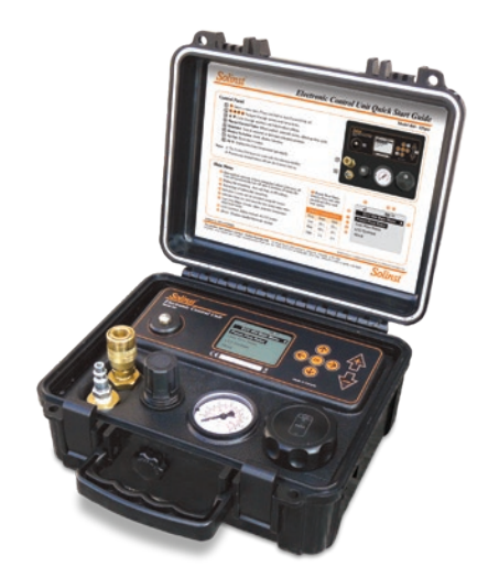
Model 464 Electronic Control Unit (125 psi and 250 psi Models)

The pump is quick to disassemble and the bladders and screens are simple to replace in the field. No tools required. Inexpensive polyethylene bladders can be quickly replaced to suit regulatory requirements.