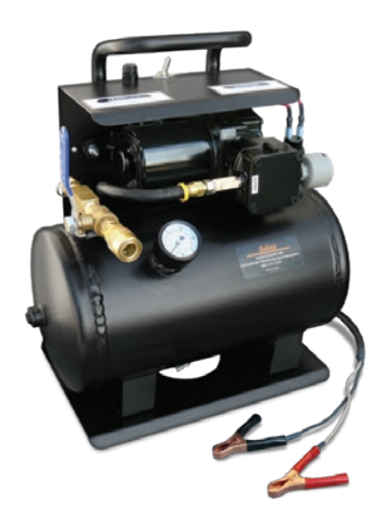
12 Volt Compressor

The compressor operates using 12 volt DC power source, such as a car or truck vehicle battery, and comes with alligator clips. The compressor operates at up to 125 psi and is equipped with a 2 US gallon (7.6 L) air tank which is rated to 150 psi.