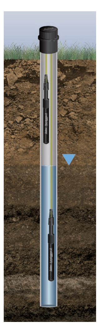
Barologger 5 and Levelogger 5 installed in Well Using L5 Direct Read Cables

L5 Direct Read Cables are available for attachment to any Levelogger in lengths up to 1500 ft. The 3.175 mm dia. (1/8") coaxial cable has an outer polyurethane jacket for strength and durability. The stranded stainless steel conductor gives non-stretch accuracy.