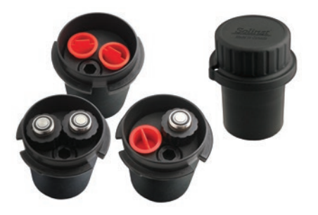
Levelogger 2" Locking Well Cap Installations (see Well Caps data sheet for more details)

The cap is vented to equalize atmospheric pressure in the well. It slips over the casing, and can be secured using a lock with a 9.5 mm (3/8") shackle diameter.