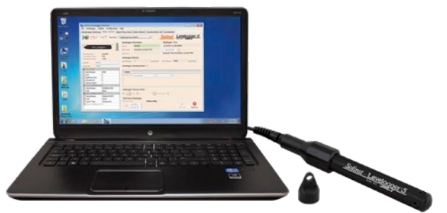
Fast communication and downloading speeds with a high speed Field Reader 5

<sup>®</sup>Solinst and Levelogger are registered trademarks of Solinst Canada Ltd.