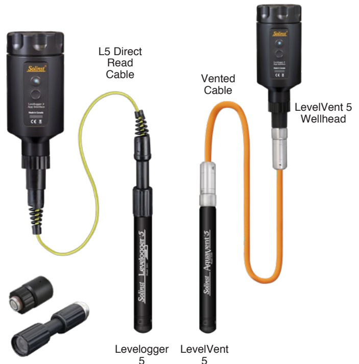
L5 Threaded and Slip Fit Adaptors allow you to directly connect your Levellogger to the Levellogger 5 App Interface.