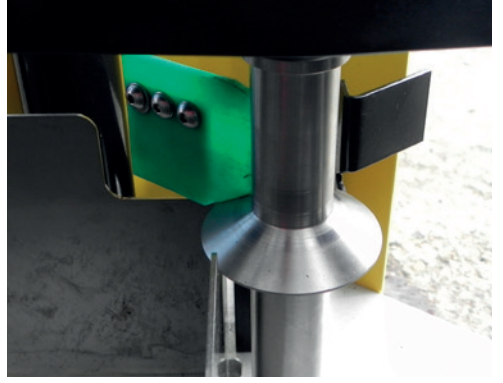
The scraper precisely fits the inner diameter of the probe, and the scraper blades ensure that the probe is emptied fully before going into the ground again.