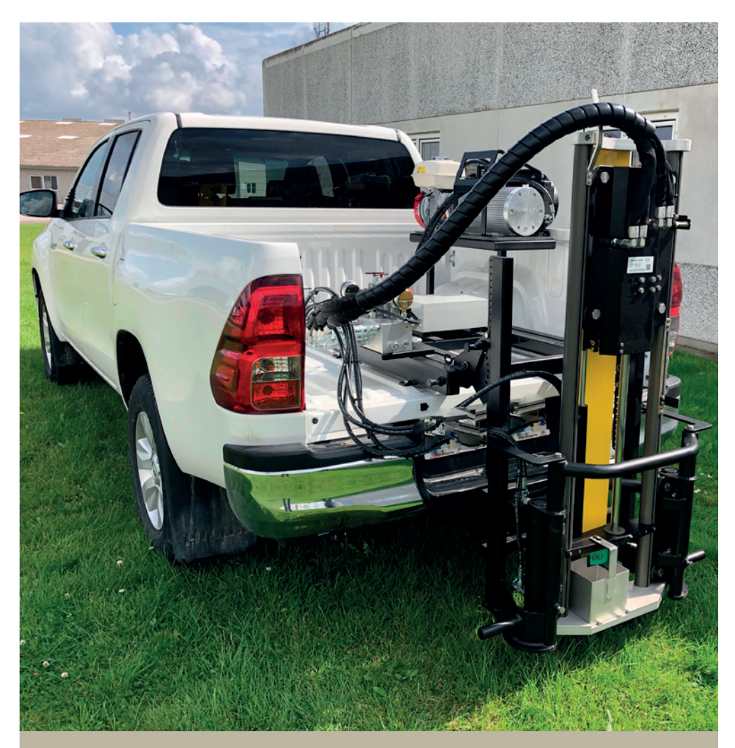
The WINTEX 1000s can be mounted on all vehicles including pick-ups, tractors and trailers.

All functions are carried out from the custom-made distribution block. The hydraulic system has a simple construction, which makes it easy to maintain.