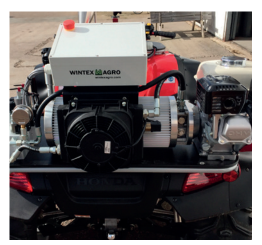
The custom-made oil tank is made of aluminum. It has a ribbed surface which means that its area is three times larger than a plain surface. Because of the aluminum and the ribbed surface the cooling capacity is 12 times higher than the cooling capacity of a traditional oil tank. This means that the tank ensures optimal cooling of the hydraulic oil.

"Our focus is consistently on user-friendliness, reliability, ruggedness and minimum maintenance, and we concentrate on what we are best at: developing and manufacturing soil samplers of the highest guality."