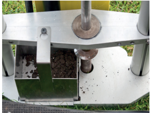
A core of soil is directly filled into the soil box. It can now be filled into a bag or a box.