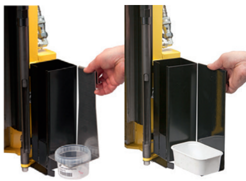
The WINTEX 1000 is available with different holding boxes which fit most of the commonly available sample boxes or with a holding box from which the sample can be filled directly into a soil bag.