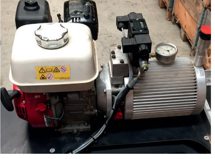
The hydraulic system is custom-made to fit the WINTEX 1000 and is mounted on a robust and strong Honda GX160 motor.