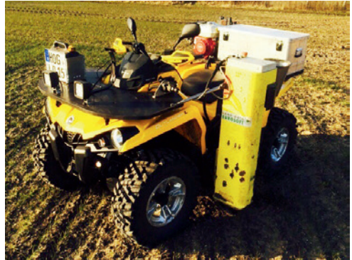
The WINTEX 1000 can be mounted on all vehicles including pick-ups, tractors and trailers