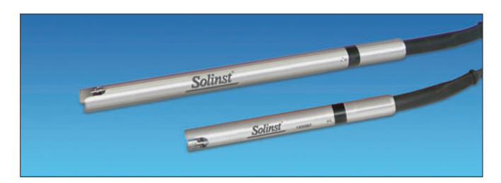
Model 122 P1 and 122M Probes