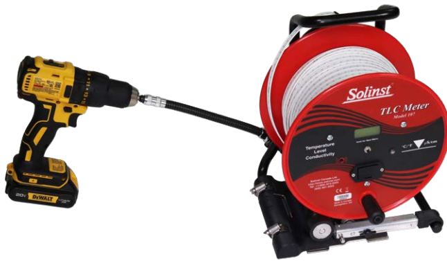
Solinst TLC Meter with Power Winder Installed to Make Temperature and Conductivity Profiling Applications Easier