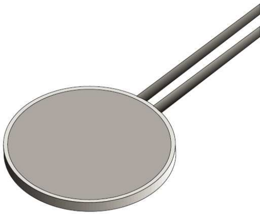
Figure 1: outlook