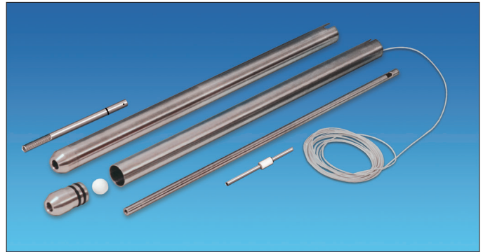
Point Source Bailers come in standard lengths of 2 ft. (610 mm), 3 ft. (910 mm), or 4 ft. (1220 mm)

The miniature 0.5" (12.7 mm) diameter model is ideal for use in narrow tubes and direct push devices.