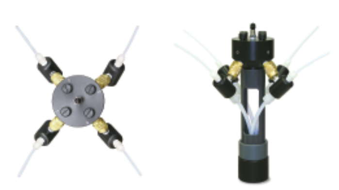
Top and Side View of Multi-Purge Manifold with 4 Pumps Connected.